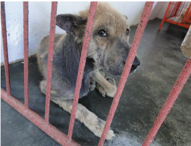
One of the oldest dog at the centre (almost 17 years old)