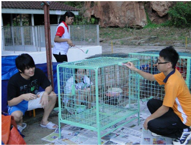
Painting the cages for the pets