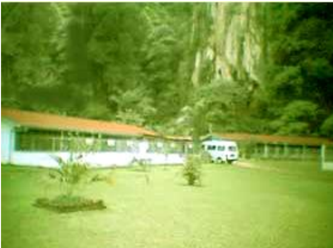
A view of the ISPCA