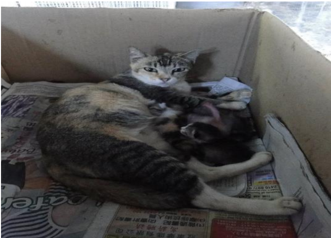
A mother cat milking her kittens