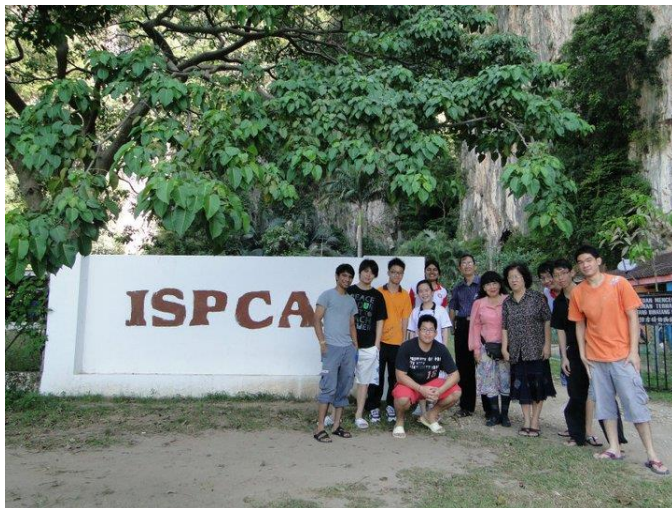
A group picture outside of the ISPCA with the owners