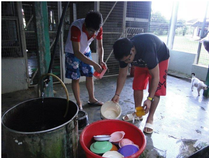
Cleaning the cattery